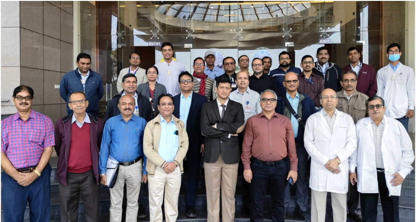
Clockwise from top: Patients undergoing OPD services at RMRC, SPECT 830 unit in routine operations, Group photograph of DAE officials.