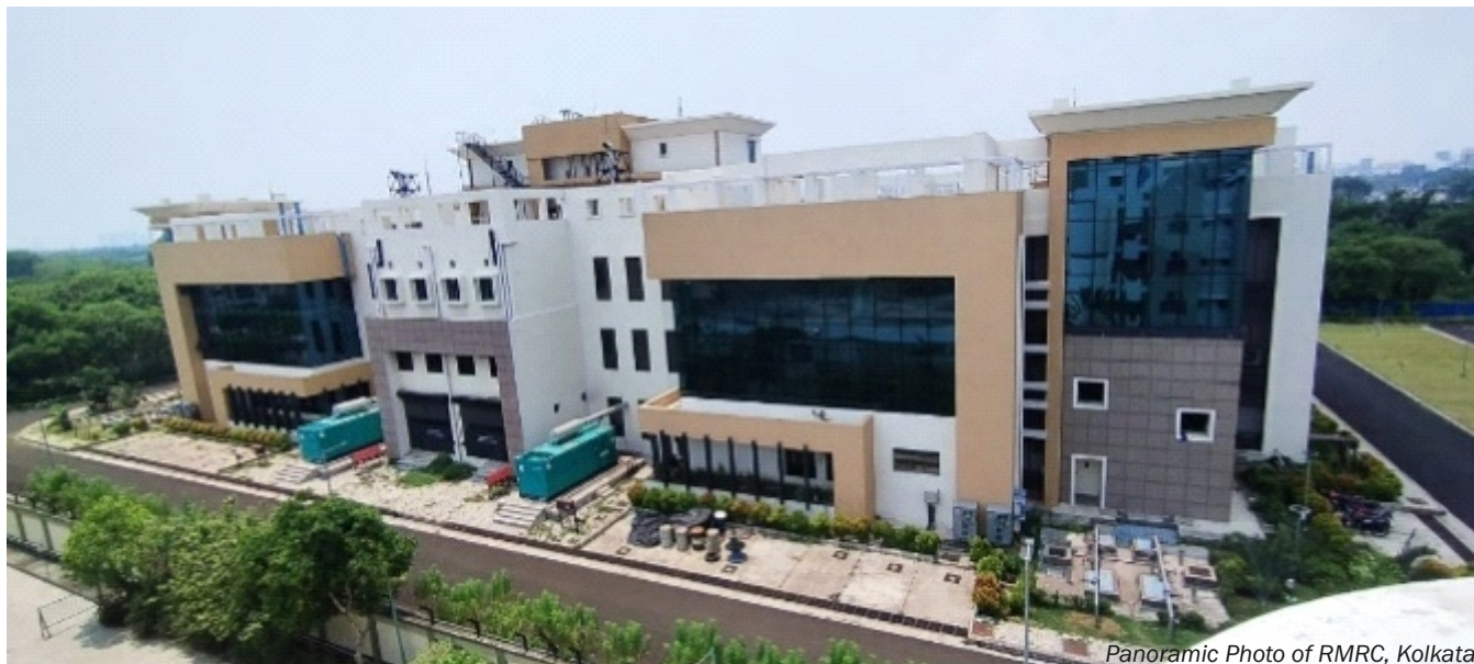
Panoramic Photo of RMRC, Kolkata